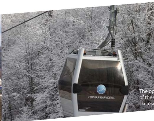
The opening ceremony of the Gornaya Karusel ski resort