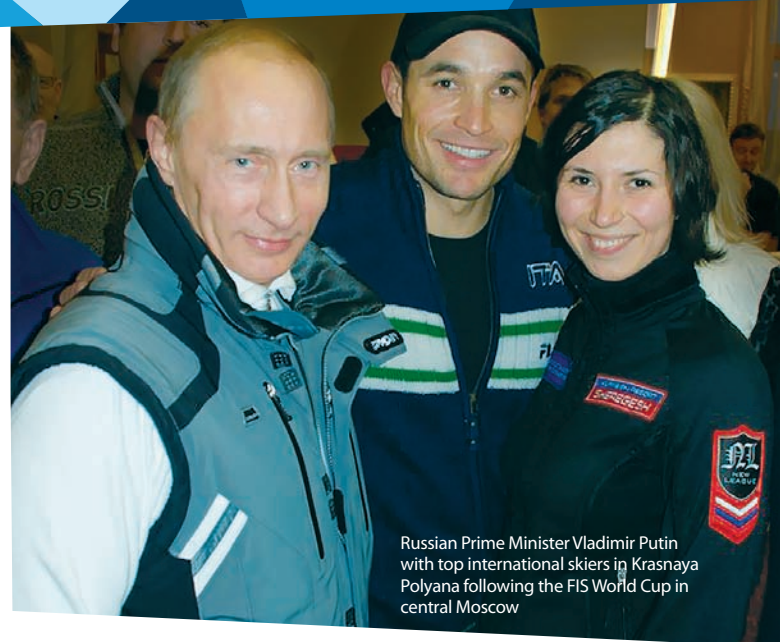
Russian Prime Minister Vladimir Putin with top international skiers in Krasnaya Polyana following the FIS World Cup in central Moscow