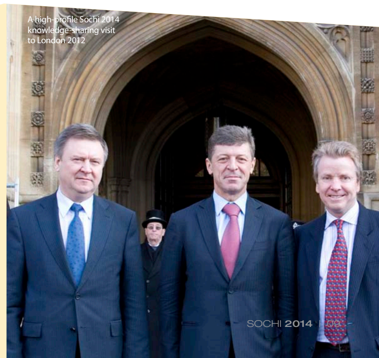
A high-profile Sochi 2014 knowledge-sharing visit to London 2012