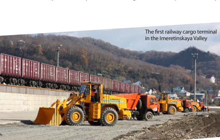
The first railway cargo terminal in the Imeretinskaya Valley

A. Without doubt, the main highlight is that Sochi is set to become one of the most active regions in the world for major construction projects. The tender process has already successfully identified strong construction partners for key projects with applications received from all over the world.