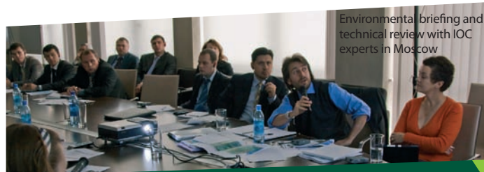
Environmental briefing and technical review with IOC experts in Moscow

The seminar included a review of Sochi 2014's environmental policies, plans for setting green targets, and past OCOG best practices.