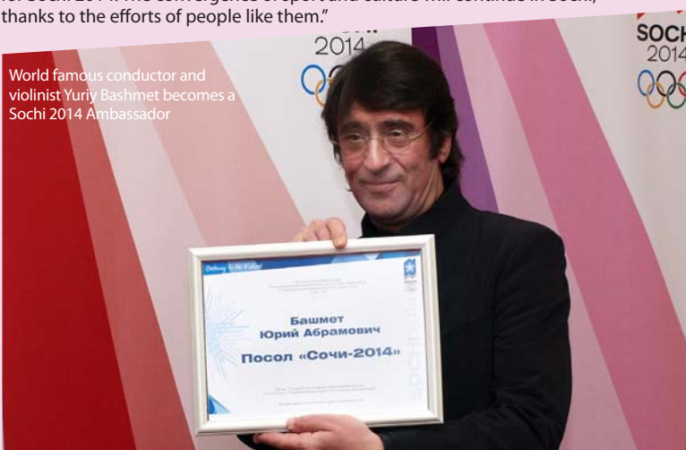
World famous conductor and violinist Yuriy Bashmet becomes a Sochi 2014 Ambassador