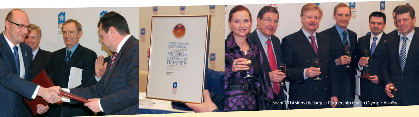
Sochi 2014 signs the largest Partnership deal in Olympic history

Further partnership announcements are expected in due course.