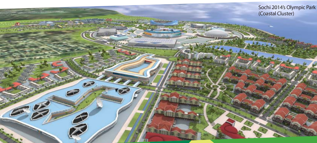
Sochi 2014's Olympic Park (Coastal Cluster)

Currently Olimpstroy has announced 9 tenders for Olympic Park infrastructure projects. Among them the tenders for construction of Maly and Bolshoi Ice Palace, Sochi Olympic Skating Centre and Olympic Curling Centre.