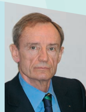
Jean-Claude Killy Chairman, IOC Coordination Commission for Sochi 2014

"I am happy to say that we feel that Sochi continues to be on track although, as I've said before, there is no time to lose and Sochi 2014 and its partners must continue to work diligently and remain focused on delivering a great Olympic and Paralympic Winter Games in 2014."