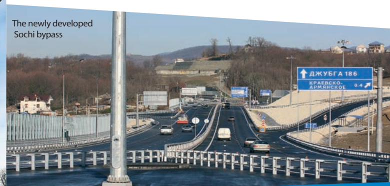
The newly developed Sochi bypass

The program includes construction of the bypass which will be fully operational in 2010, a road bridge over a river in the central region of Sochi and transport interchanges on various roads within the region. All of these projects are seen as critical to the smooth running of the winter Games and are currently on schedule and within budget.