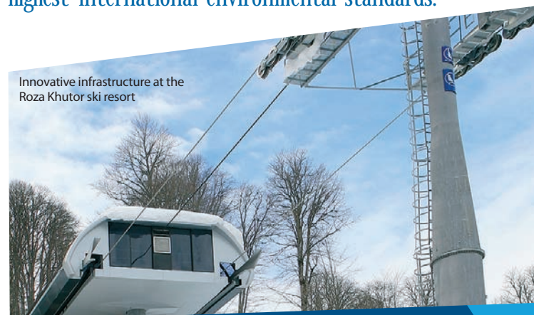
Innovative infrastructure at the Roza Khutor ski resort

"The resort, which will host the elite alpine ski events in 2014, is being constructed to meet, and exceed, the Russian ecological legislation and the highest international environmental standards."