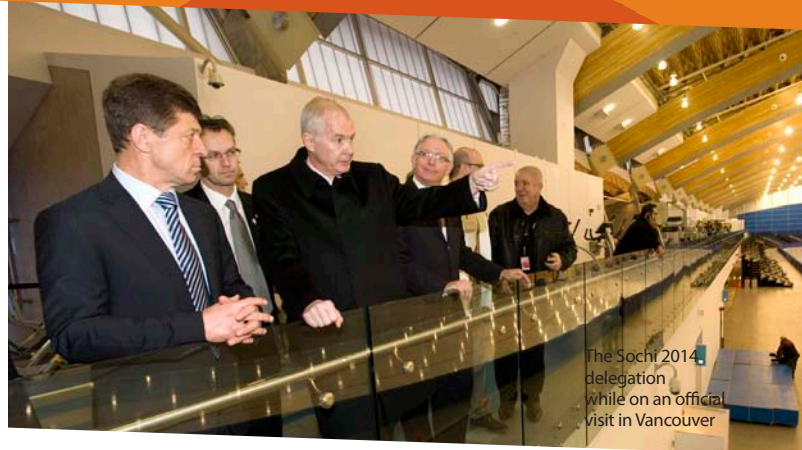
The Sochi 2014 delegation while on an official visit in Vancouver

The delegation also had meetings with Tessa Jowell, Minister of State (for the Olympics), and Lord Moynihan, Chairman of the British Olympic Association.