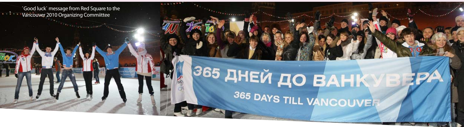
'Good luck' message from Red Square to the Vancouver 2010 Organizing Committee