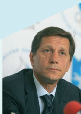
Alexander Zhukov Deputy Prime Minister of the Russian Federation and Chairman, Sochi 2014 Supervisory Board

"We have a very solid financial safety buffer to cope with the current situation, with $12 billion of Federal Government funds already set aside for the Olympic project. As Prime Minister Putin recently stressed: "Not a single Russian investor has given up his/her initial plans. We will meet our commitment for Games-related outlays of $3.2 billion this year and $3.6 billion in 2010."