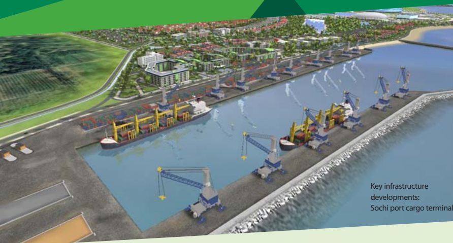
Key infrastructure developments: Sochi port cargo terminal and the new Sochi airport